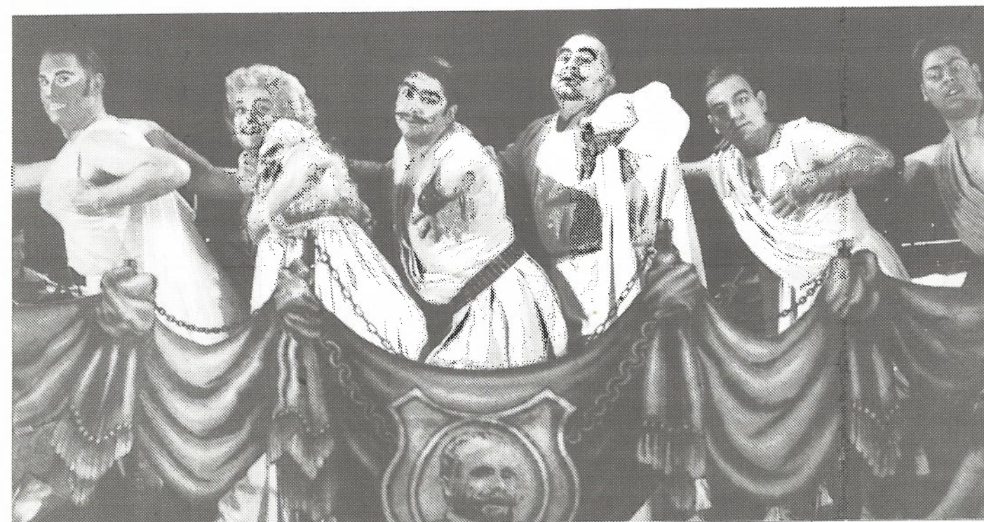
Above: One of the more serious scenes from Baz Luhrman's colourful production of Britten's, A Midsummer Night's Dream .

Newsletter of the Entertainment Access Service - a project of Arts Access ISSN 1038-2879 Autumn 1994