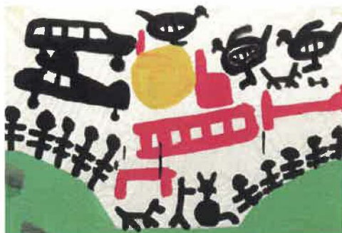
Don Young (Easter and Flying Buses) c. 1980 Poster Paint 51x75cm