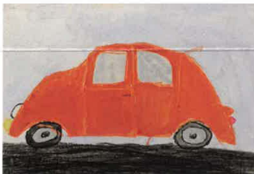
Bill Griffiths (Volkswagon) c. 1970 Oil pastel and poster paint 38x56cm