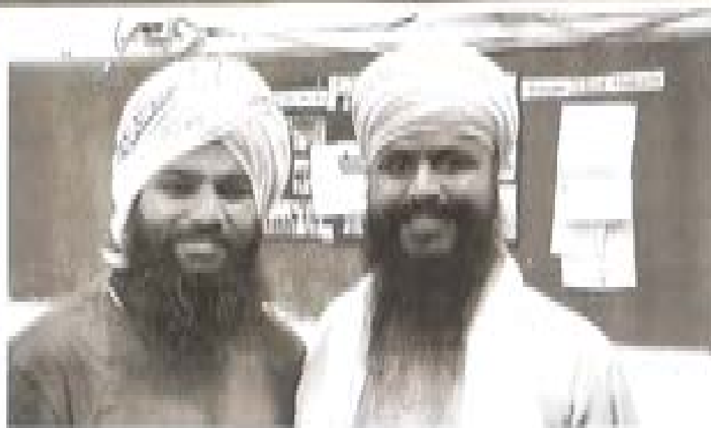
Peckers Art Fair