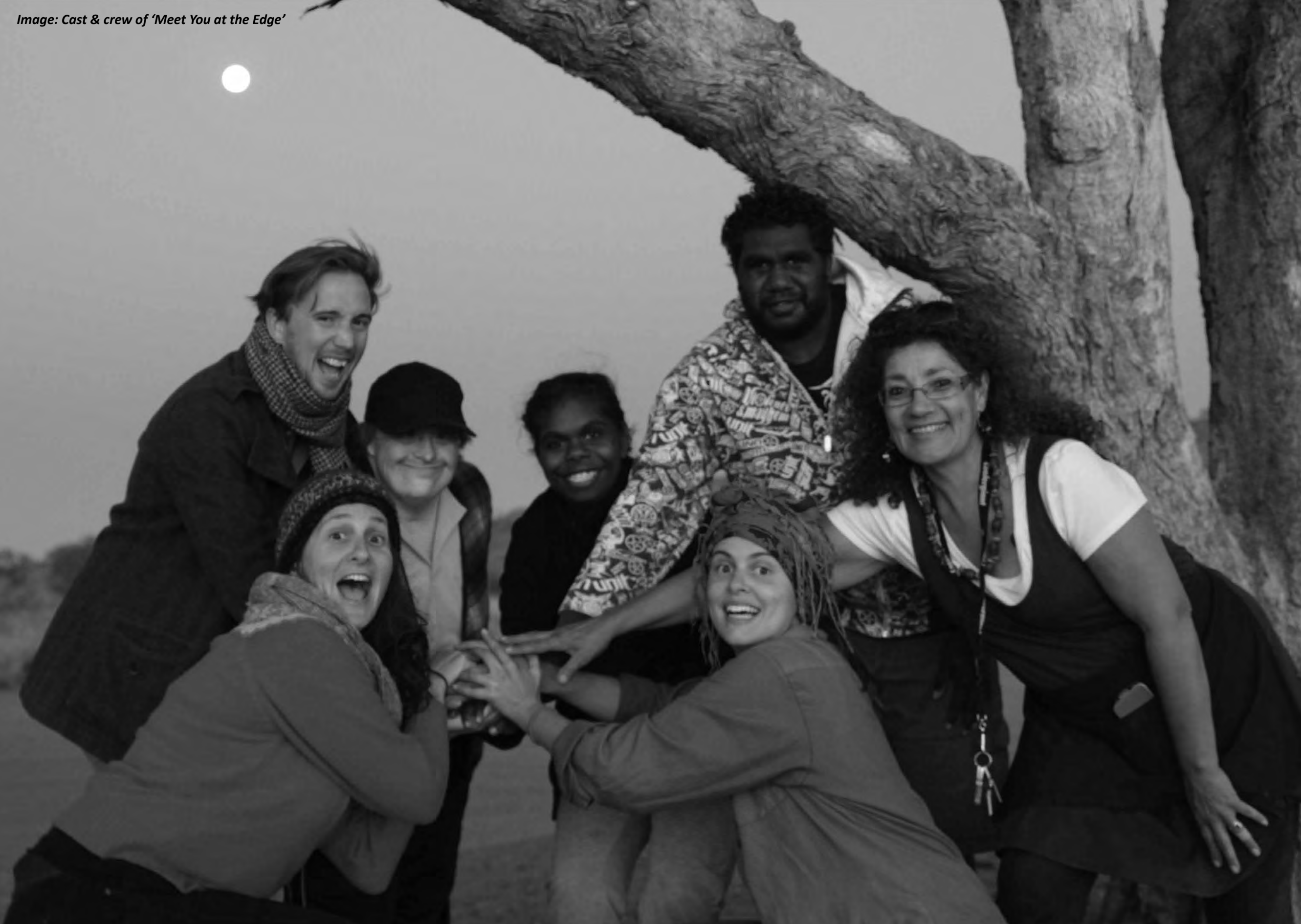
Image: Cast & crew of 'Meet You at the Edge'