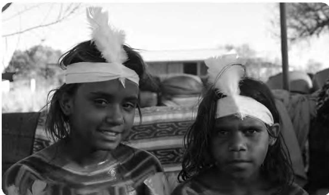
Southern Ngalia young dancers

Without this trust, it’s impossible to achieve this engagement. Both projects continue to progressively evolve with each new engagement, to build community capacity and to impact on the lives of those involved.