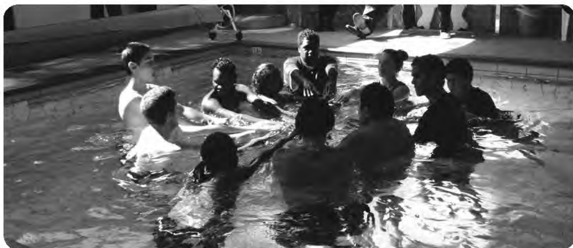
Image: Acacia Hill students performing at the hydrotherapy pool opening