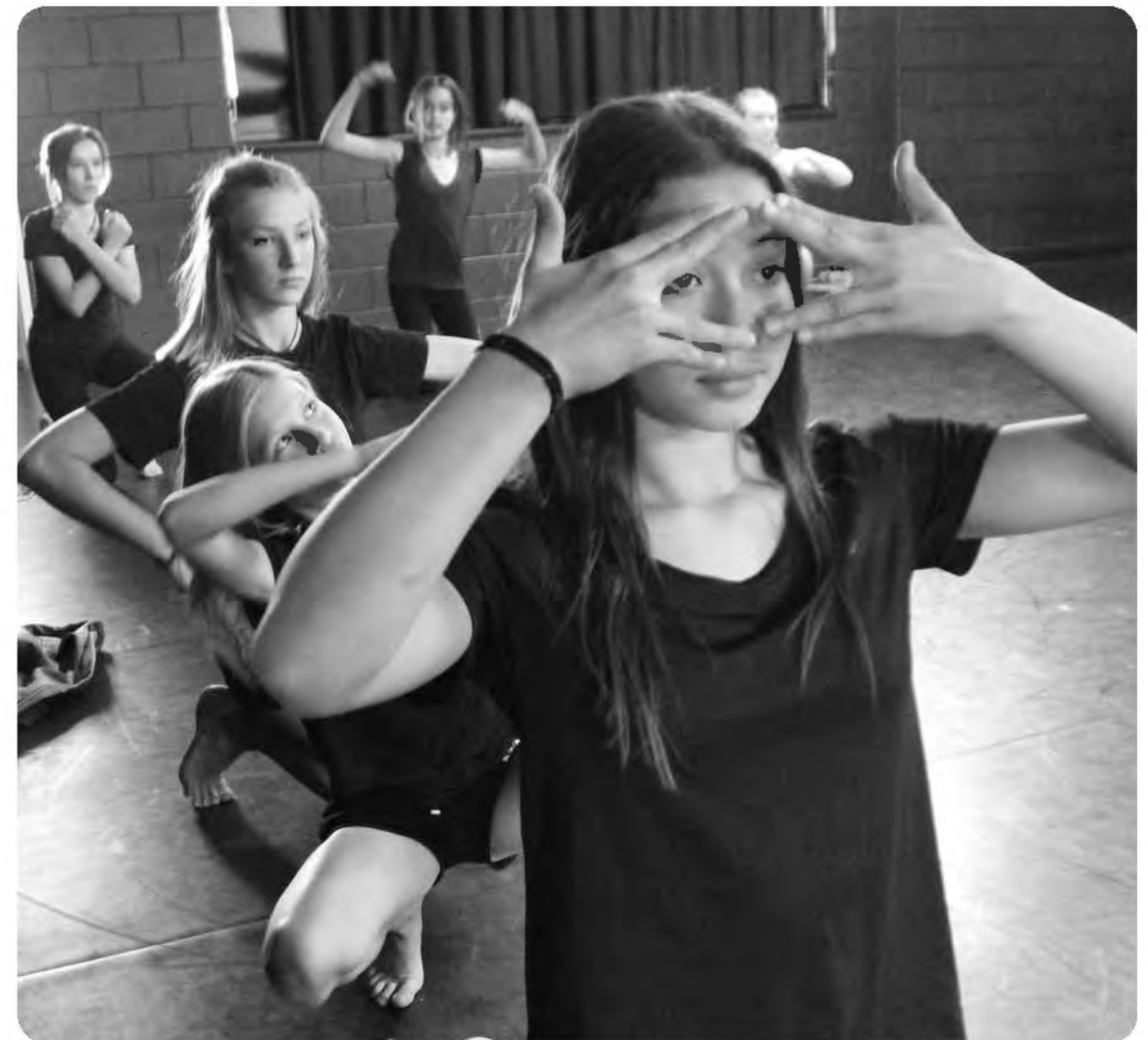
Image: SPRUNG dancers, 'Big Smoke Big Red' rehearsal

Once again the SPRUNG program continued to build the culture of youth dance in Central Australia.