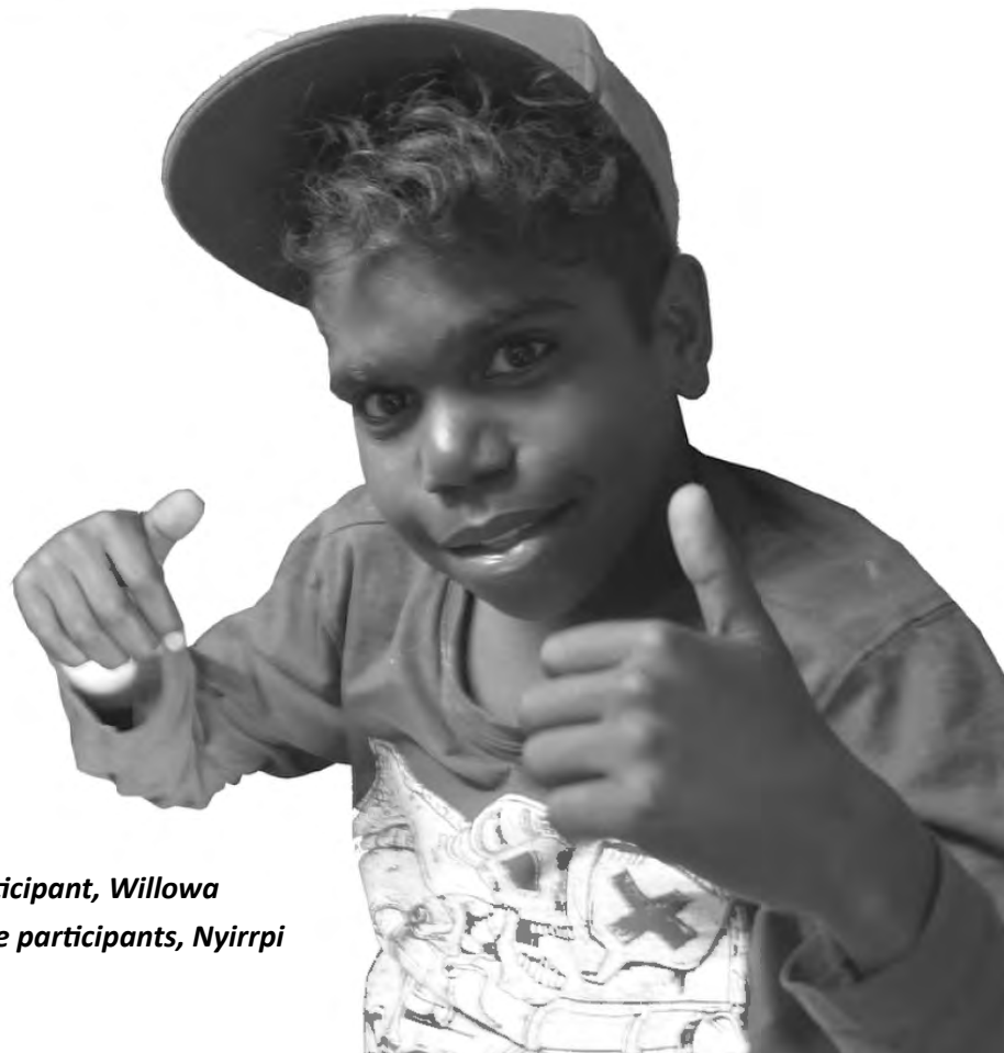
Image: Red Sand Culture participant, Willowra