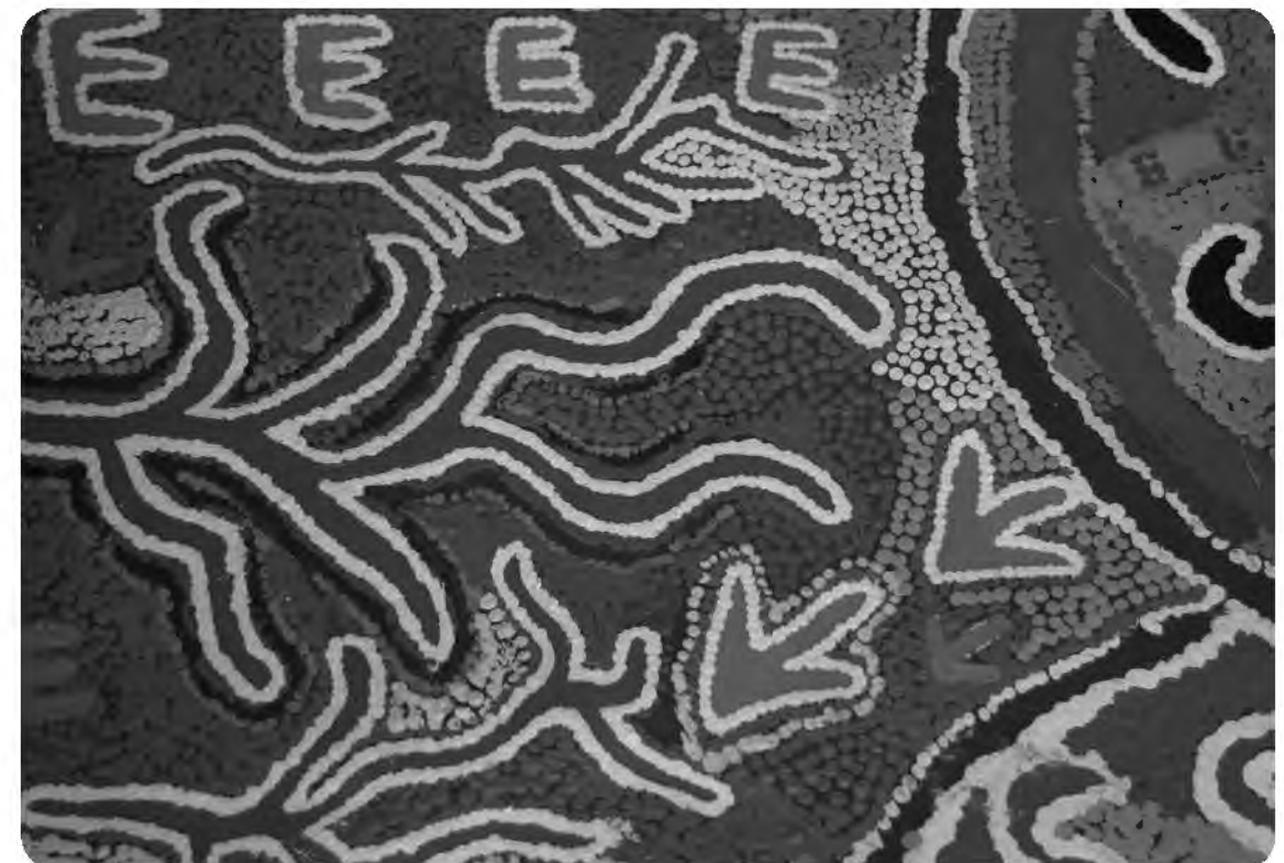
Image: Section of the Southern Ngalia painting