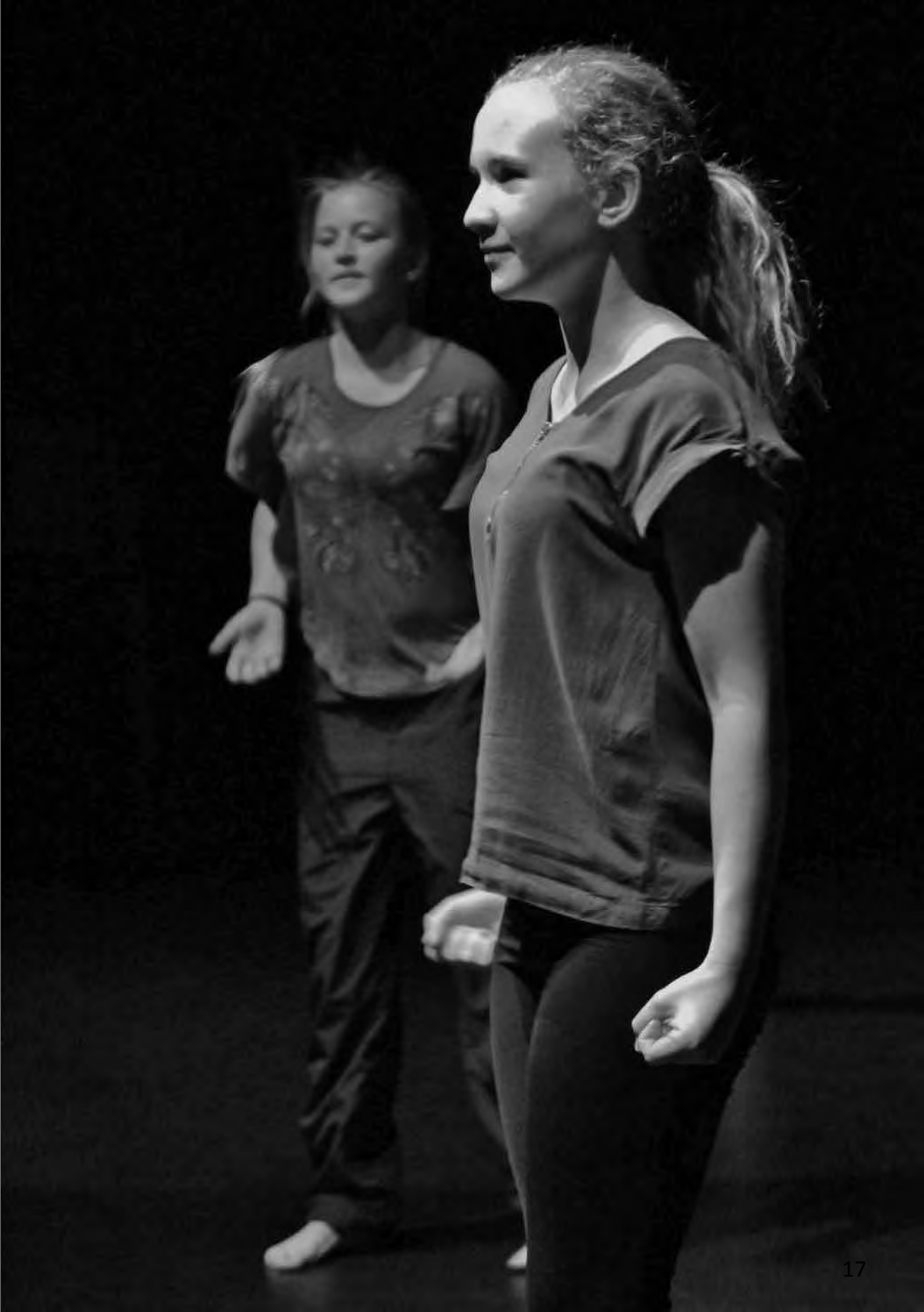
Image: SPRUNG dancers, 'Big Smoke Big Red'