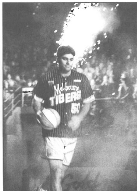
EASE continues to develop ticketing arrangements with sporting venues.

June 1, Tigers vs Canberra* June 18, Tigers vs Adelaide* June 26, Tigers vs Brisbane* July 25, Tigers vs Hobart* August 13, Tigers vs S.E. Melbourne* August 20, Tigers vs Newcastle August 30, Tigers vs Perth September 11, Tigers vs Illawarra